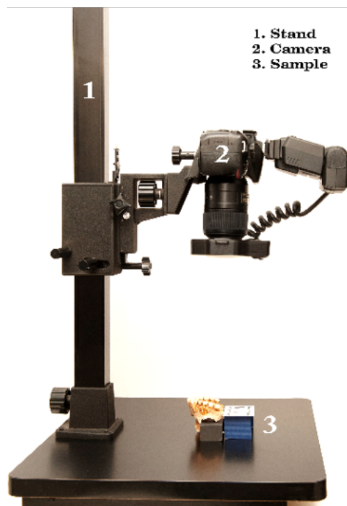
Figure 1. Schematic representation of the recording of occlusal surfaces of skeletal remains in this research

during the archaeological excavation process. Since this study aimed to analyze tooth wear, teeth affected with severe carious lesions were also excluded, which brings the total number of excluded teeth to 1563 of all teeth from all maxillary and mandibular remains. Regarding the historical periods, the LA period had 739 lost and 26 caries-affected teeth, while the EMA period had 748 lost and 40 caries-affected teeth. The study included 4408 teeth, of which 1545 molars, 1224 premolars, 647 canines, and 992 incisors.