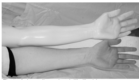
Fig.1: A three-dimensional, life-like bite target cast as a silicone replica from the impression (top) of an actual arm (bottom), fitted with a rigid bony interior.

components analyses on the partial warp scores. These were derived from partial Procrustes coordinates aligned by means of thin-plate spline decomposition based on a bending energy matrix.