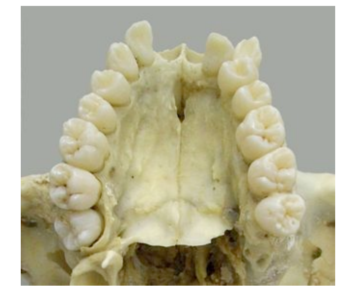
Figure 1: Upper dental arch, with buccally placed left canine

Approximately one month later, a man went to the local Medico-Legal Institute, searching for information about his 23 year-old missing niece. When asked about dental records, the man said she never had dental decay or restorations, but one tooth was "displaced forward." This information drew the attention of the experts, who requested smiling antemortem photographs of the young The images provided were woman. digitalized, stored in a database, and analyzed by the graphic manager Adobe Photoshop,<sup>™</sup> allowing the forensic experts to identify the same dental anomaly (23), in the exact position as observed on the skull (Fig. 2), as well as all the other remaining visible teeth.