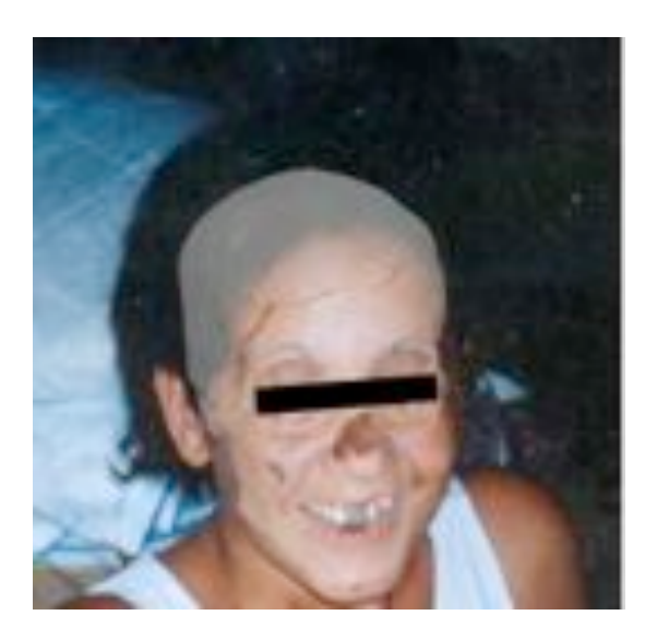
Figure 4: Superimposition skull-photo with two degrees of opacity

10. The mental protuberance of the mandible lies posterior to the point of the chin.