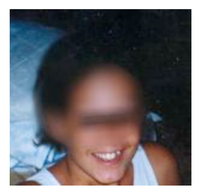
Figure 2: Submitted antemortem photograph

After that coincidence, which, according to many authors, is sufficient to establish a positive identification,<sup>3,4,14</sup> the team took pictures of the skull using a digital camera of 6.0 megapixels, in an attempt to reproduce the angle of the face as shown on the photograph (Fig. 3). Following storage in the database, the size of the images ante and